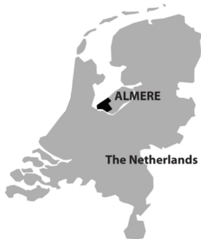
Figure 2: The location of Almere in The Netherlands

One of the Dutch municipalities trying to organize for “organic development” is Almere. Almere can be seen as an interesting example of moving from one side of the spectrum to the other: from the blue-print approach to more spontaneous development (Cozzolino 2015a). The city is an “extreme case” (Flyvbjerg 2006) of the change in Dutch planning and development. Almere is situated approximately 30 kilometers northeast of Amsterdam. The city was