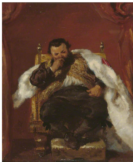
Fig. 4: John Gilbert, Don Sancho Panza, Governor of Barataria (1875)

There are exceptions—for example, its dystopian futuristic denouement in the manner of Huxley or Orwell—but DA2 consists mostly of Tocqueville’s musings on the metamorphosis of the old European aristocracy into the new American industrial class and the parallel transformation of the caste of serfs into the modern working class. These social shifts accompany the transfer of political power from the leaders who dominated ancient and medieval times to the masses in control of modern democracies. In the more imaginative context of DA2, specific jurisprudential structures fade away; likewise, in DQ2, the Kingdom of Barataria and “The Constitutions of the Great Governor Sancho Panza” muddle positive and negative examples of governance (see DQ 2.45-51). From a liberal perspective, however, the squire’s virtue lies in his attempt to rule in DQ2 according to the textual legacy of his master. Likewise, what matters in DA2 is the pedagogical transmission of virtues between successive generations and castes. In the early seventeenth century, Cervantes foresees a mode of mass rule whereby a man akin to Sancho Panza will rise to the helm of a transatlantic superstate. Tocqueville then lives that event.