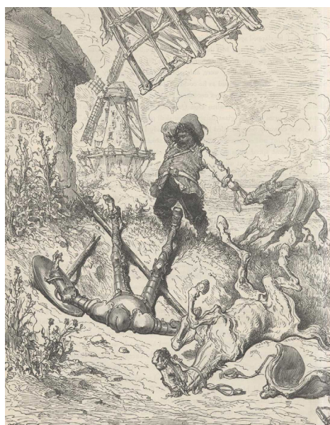
Fig. 3: Gustave Doré, Don Quijote 1,8 (1863)

In a letter to his friend Gustave de Beaumont on March 21, 1838, that is, as he was putting the final touches on DA2, Tocqueville (1861) describes himself as an aristocrat alone in a vulgar world already under the sway of bourgeois masses. He uses a precise literary analogy to describe how a recent brush with Plutarch